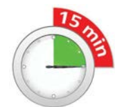
Take pulse & BP