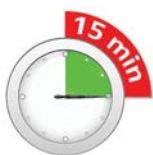
Take pulse & BP