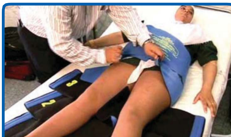
If no change >20 in pulse or BP, open segment #4