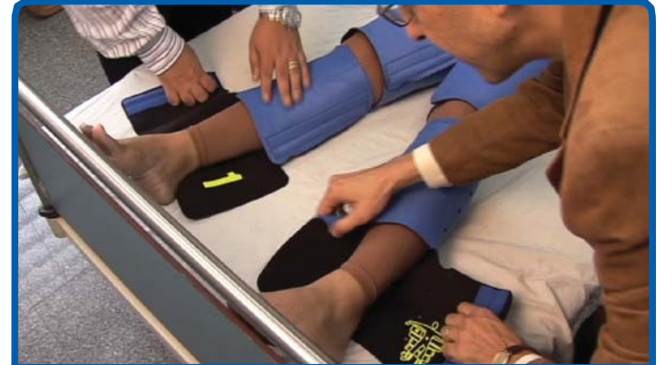
Open segment pair #1 (#2 for short women)