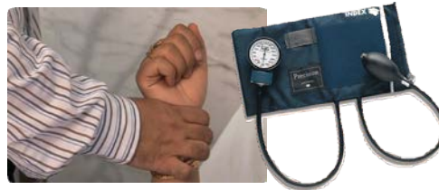
Take pulse & BP