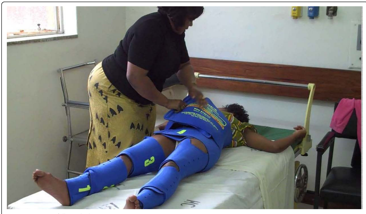
Figure 1 An NASG fully applied.

Health, and the Ethics Committees of the El Galaa Maternity Teaching Hospital and Assiut University Women's Health Center gave ethical approval for the study. After an explanation of study aims, risks and benefits, all pre-intervention study participants gave verbal consent, and all NASG participants gave written consent to the use of the NASG. A United States Federal waiver of consent/authorization for minimal-risk research (45 CFR 46, 45 CFR 164.512) was obtained so that women who were unconscious or confused at the time of study entry were enrolled in the study without consent or with a relative's consent. Once the woman had regained consciousness and attained a normal sensorium, she was consented and gave written permission, even if a relative had given consent on her behalf while she was unconscious.